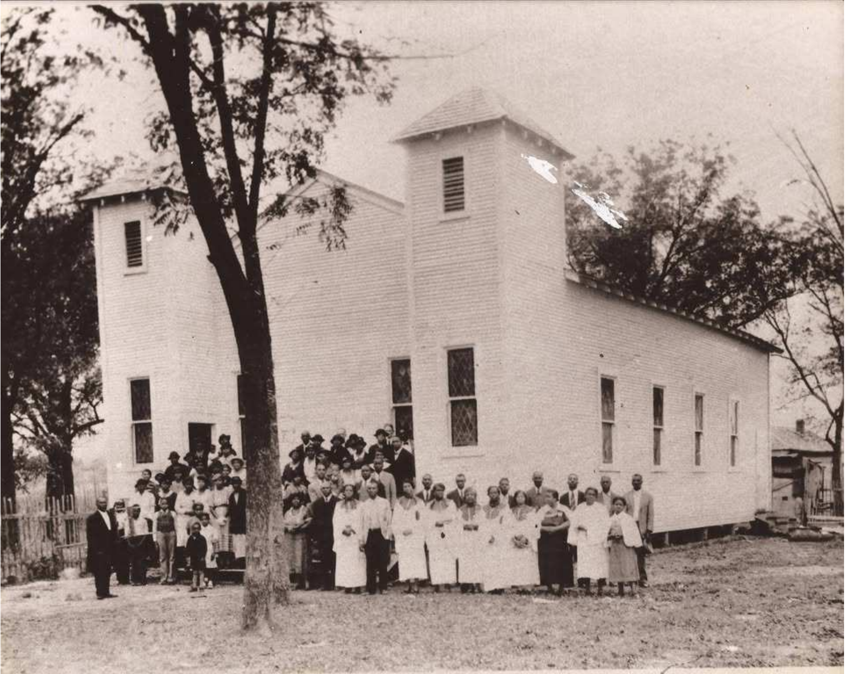
Carter Temple C.M.E. Church (formerly Jackson Temple C.M.E) – c. 1935 5 – at today's 2503 Crossman Avenue