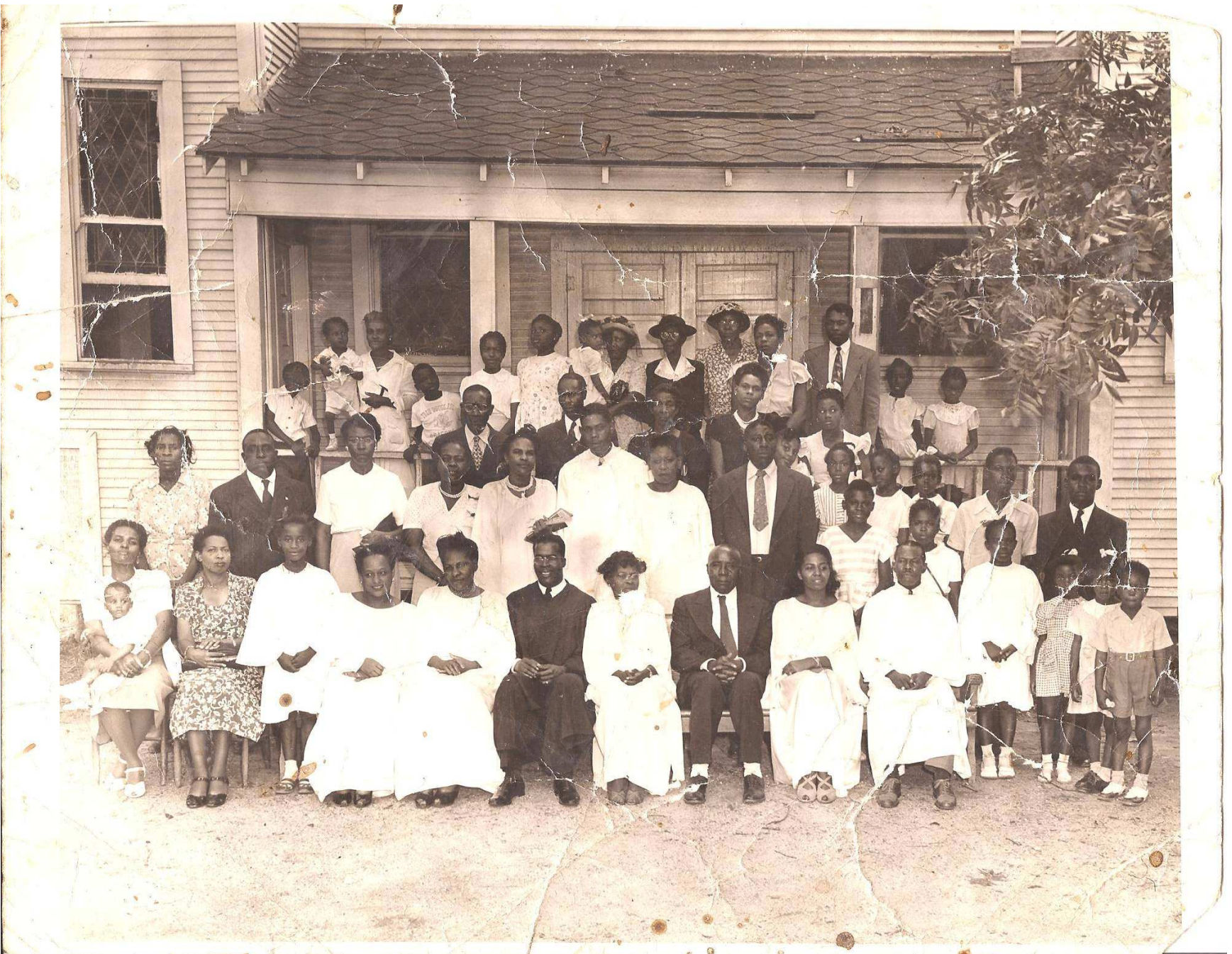
Carter Temple C.M.E. Church (formerly Jackson Temple C.M.E) – c. 1940s 6 – at today's 2503 Crossman Avenue