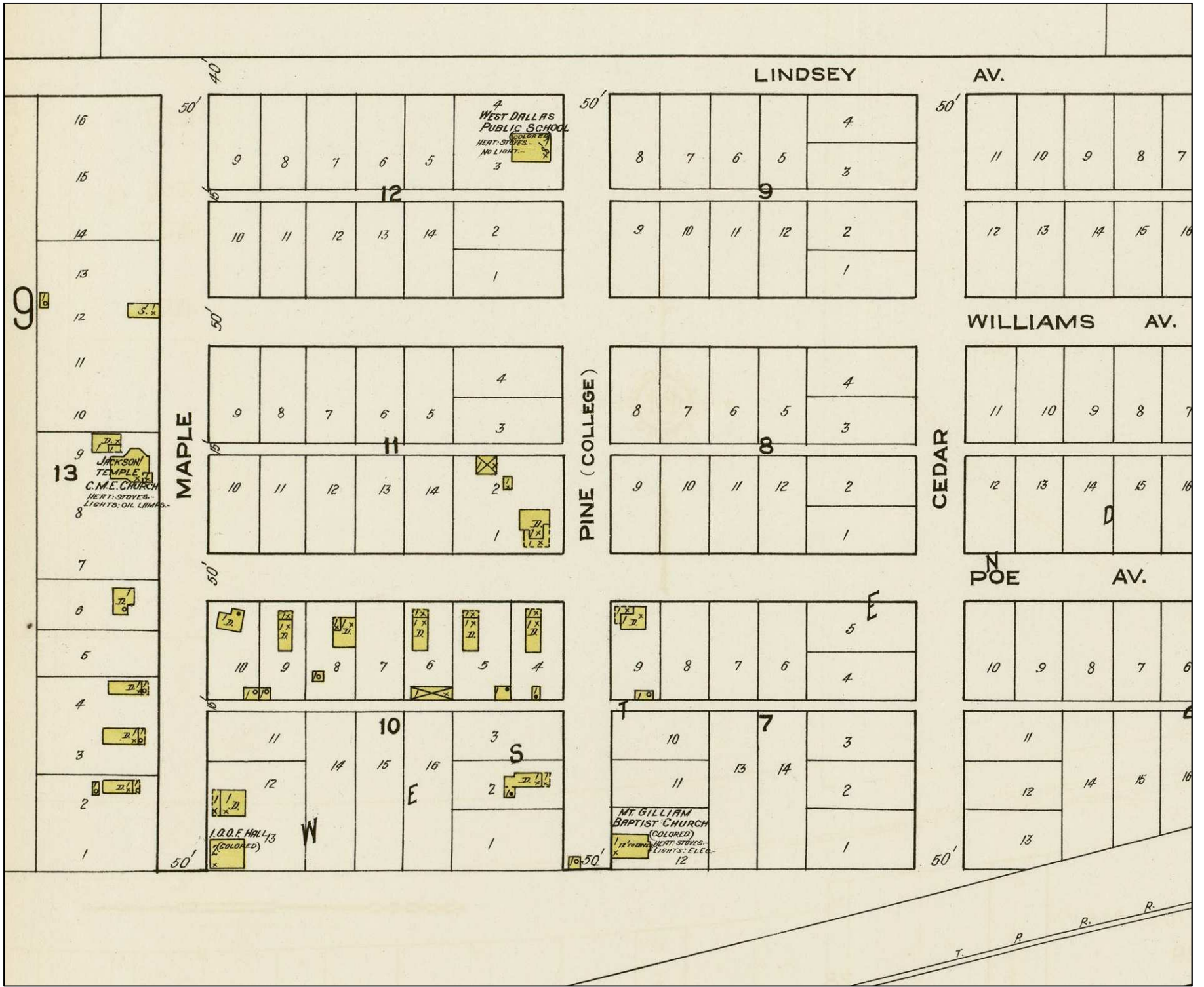
1922: Sanborn Insurance Map; Dallas, Texas, Volume 5, Sheet 580 (fragment from)

Mt. Gilead Baptist Church (incorrectly labeled "Mt. Gilliam" ) was at today's 2402 N. Winnetka: ~32.7743°N, 96.8401°W). Even in 1922, the subdivision was still sparsely filled-in. A school West Dallas Public School (Colored) started there by 1894, then later moved to its own building about 2 1/2 blocks north (32.7767°N, 96.8401°W). Jackson Temple C.M.E. Church stood at today's 2503 Crossman Avenue (~32.7752°N, 96.8414°W). West End Addition was still sparsely occupied in 1922. Street names have all changed: Pine (College) to Winnetka; Poe to Muncie; Williams to Bayonne; Lindsey to Duluth; Cedar to Conklin; Maple to Crossman.