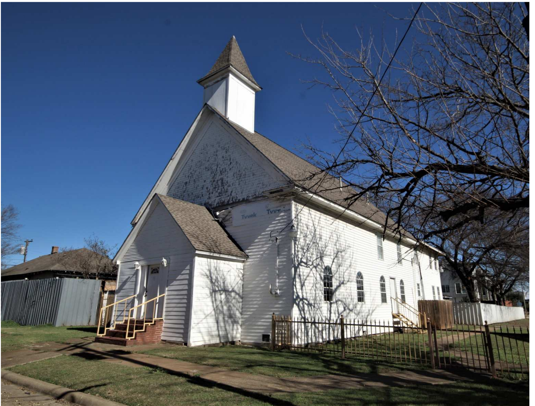
This 1890 building for the West Dallas Church of Christ has been altered and enlarged several times. 1912 North Winnetka; Dallas, Texas 75208 -- 32.77°N; 96.84°W -- photo taken in January 2026