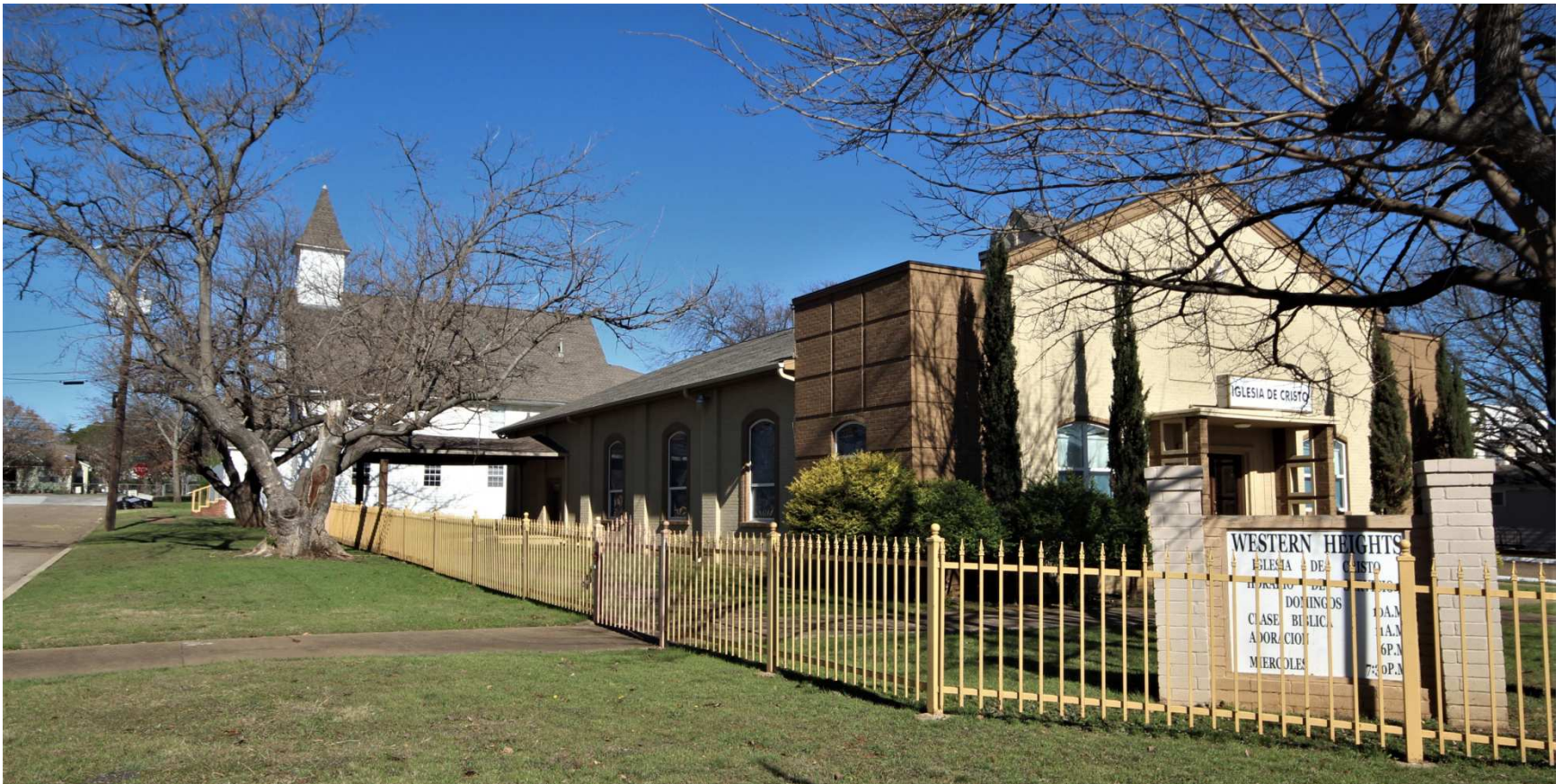
Western Heights Church of Christ constructed this new sanctuary building, south of the original building, in 1951 3 Today both buildings are owned by the congregation of Iglesia De Cristo -- photo taken in January 2026