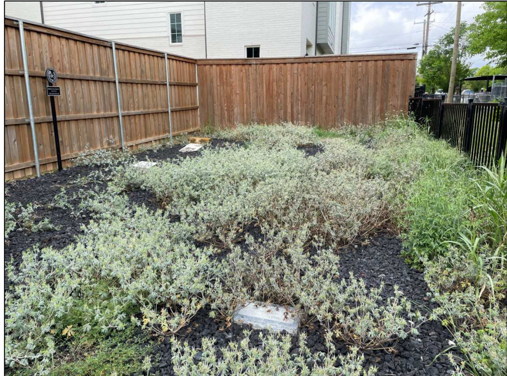
Robinson family cemetery – April 2026 – view looking southwest